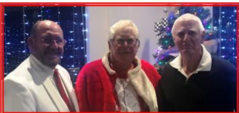
Leaders & Winners