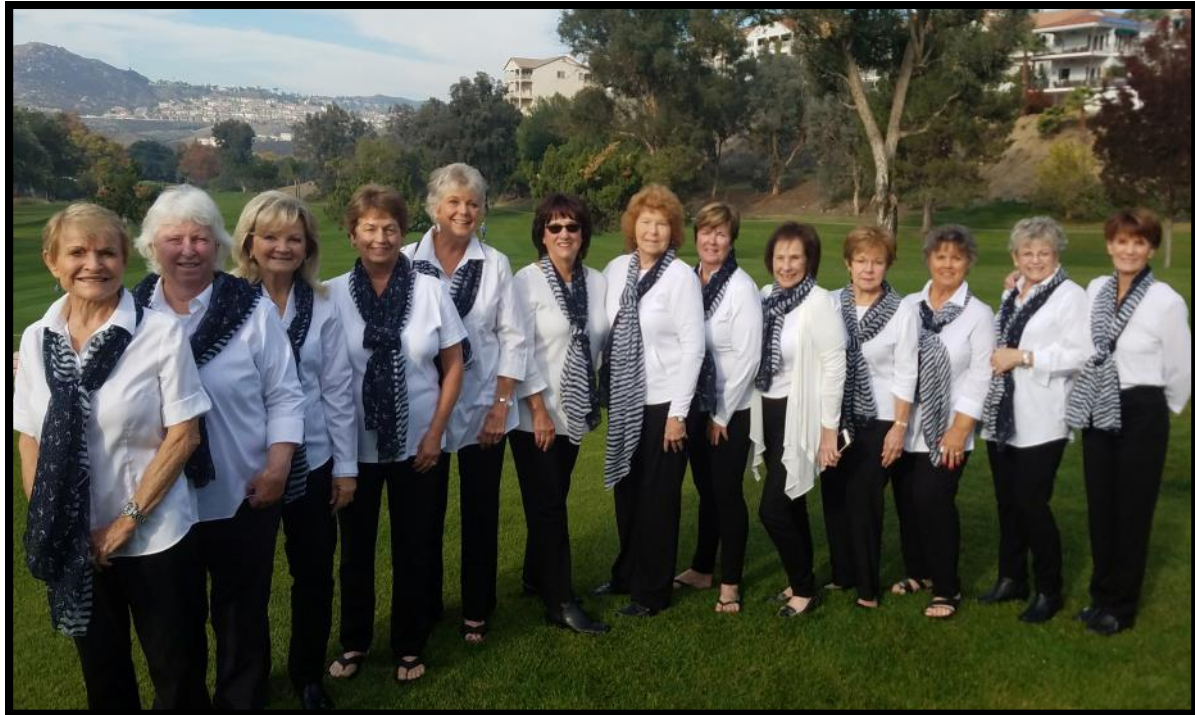
2019 Board of Directors