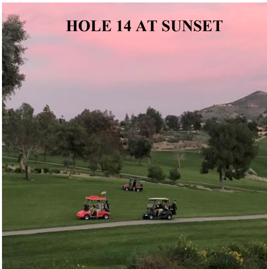
HOLE 14 AT SUNSET